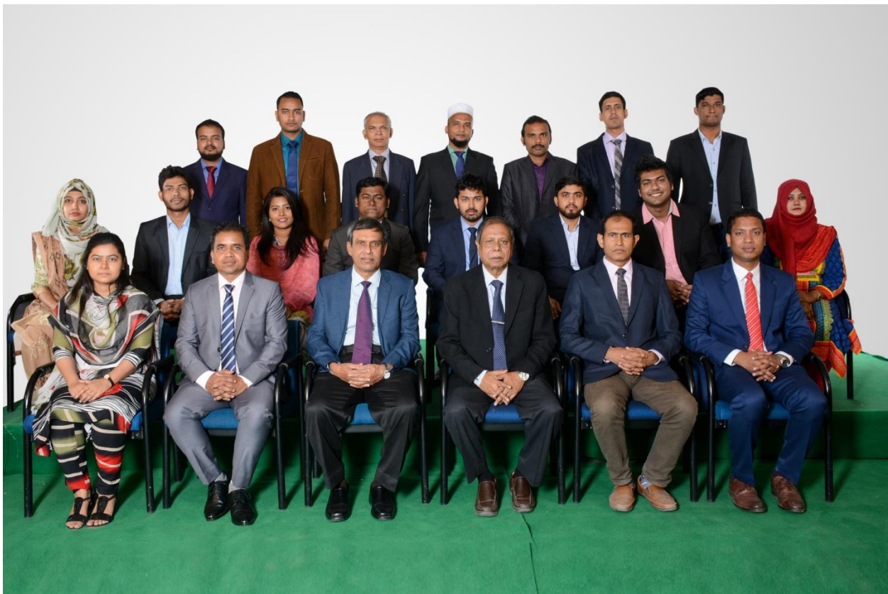
Photo-1: Group photograph of all faculty members of the Department